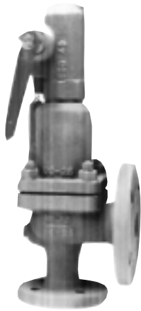
Model EP 496

Cast iron body Stainless steel internals